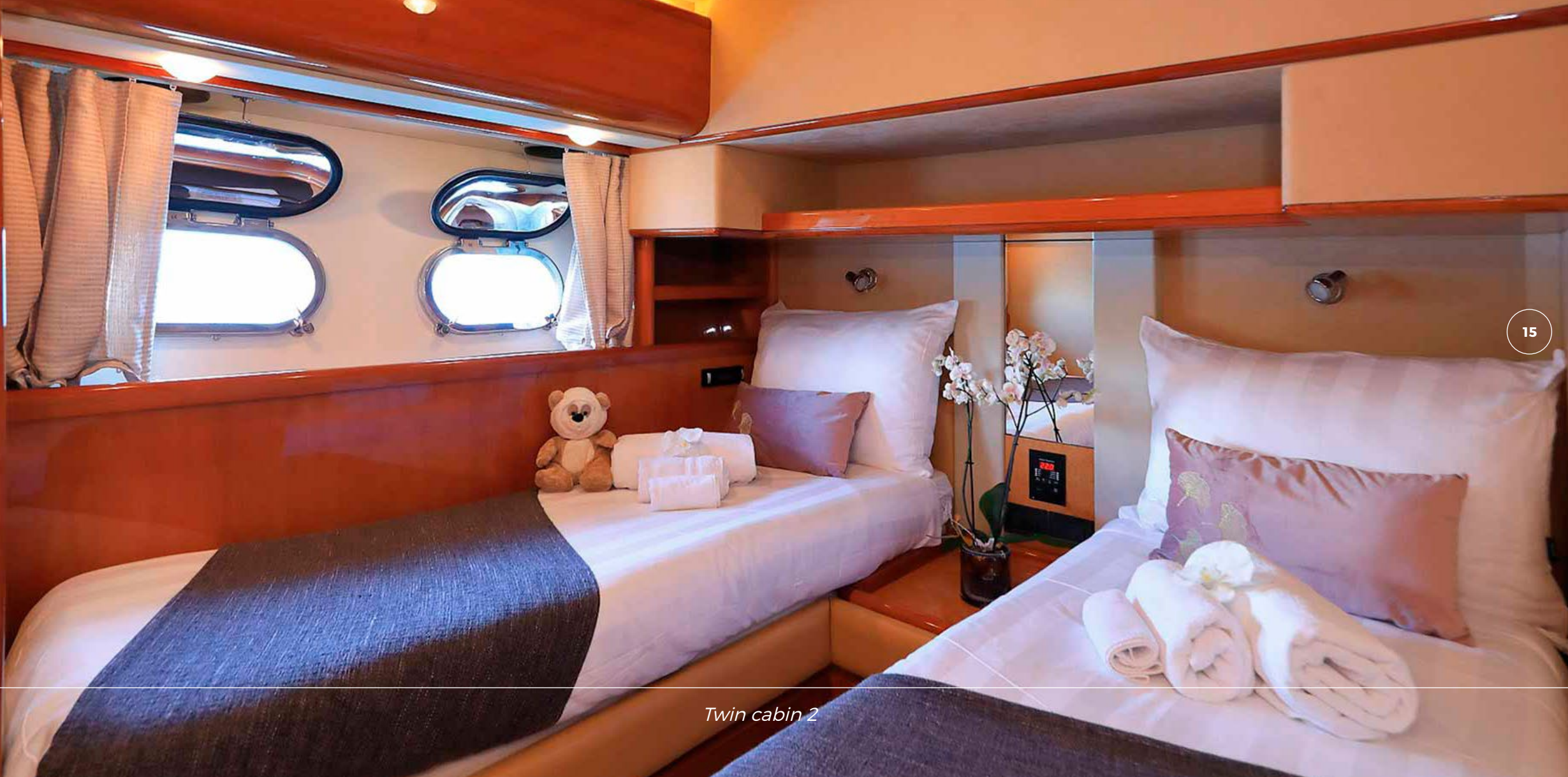
Twin cabin 2