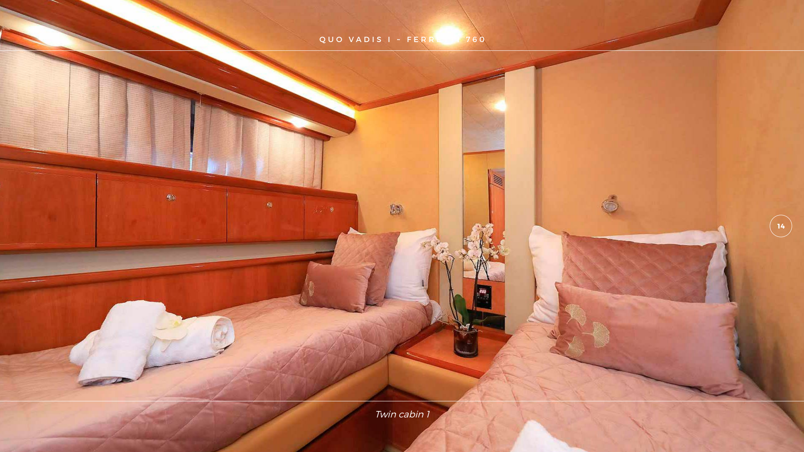
Twin cabin 1