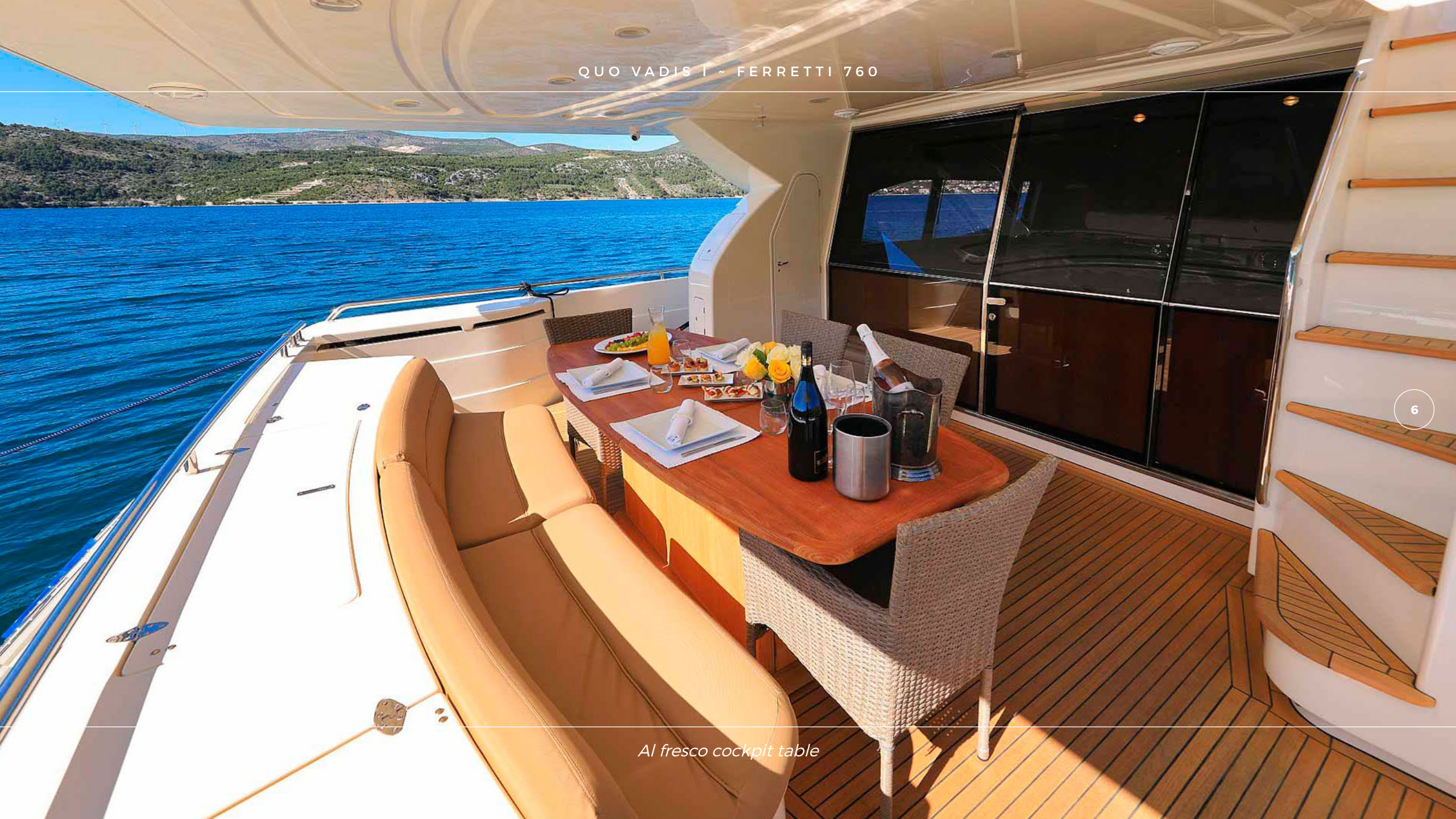
Al fresco cockpit table