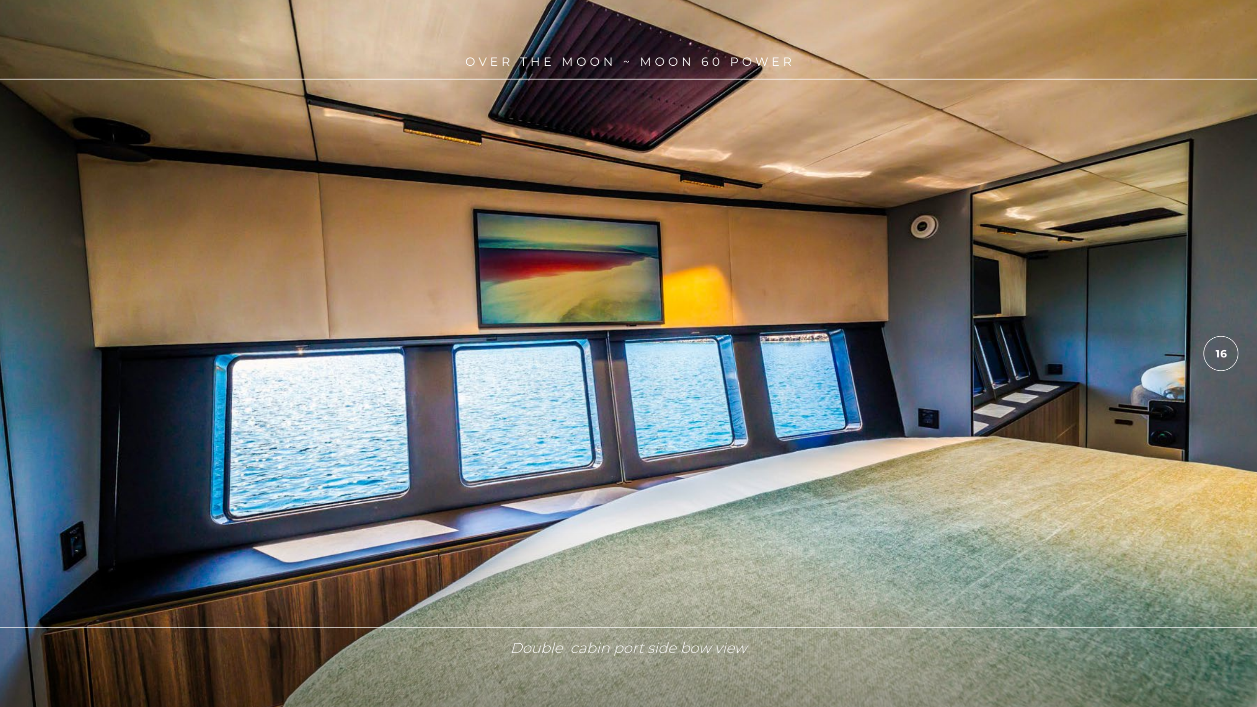
Double cabin port side bow view