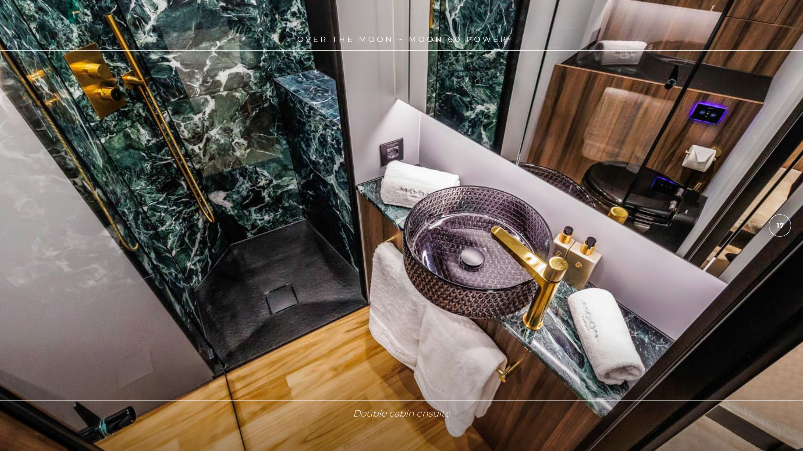
Double cabin ensuite