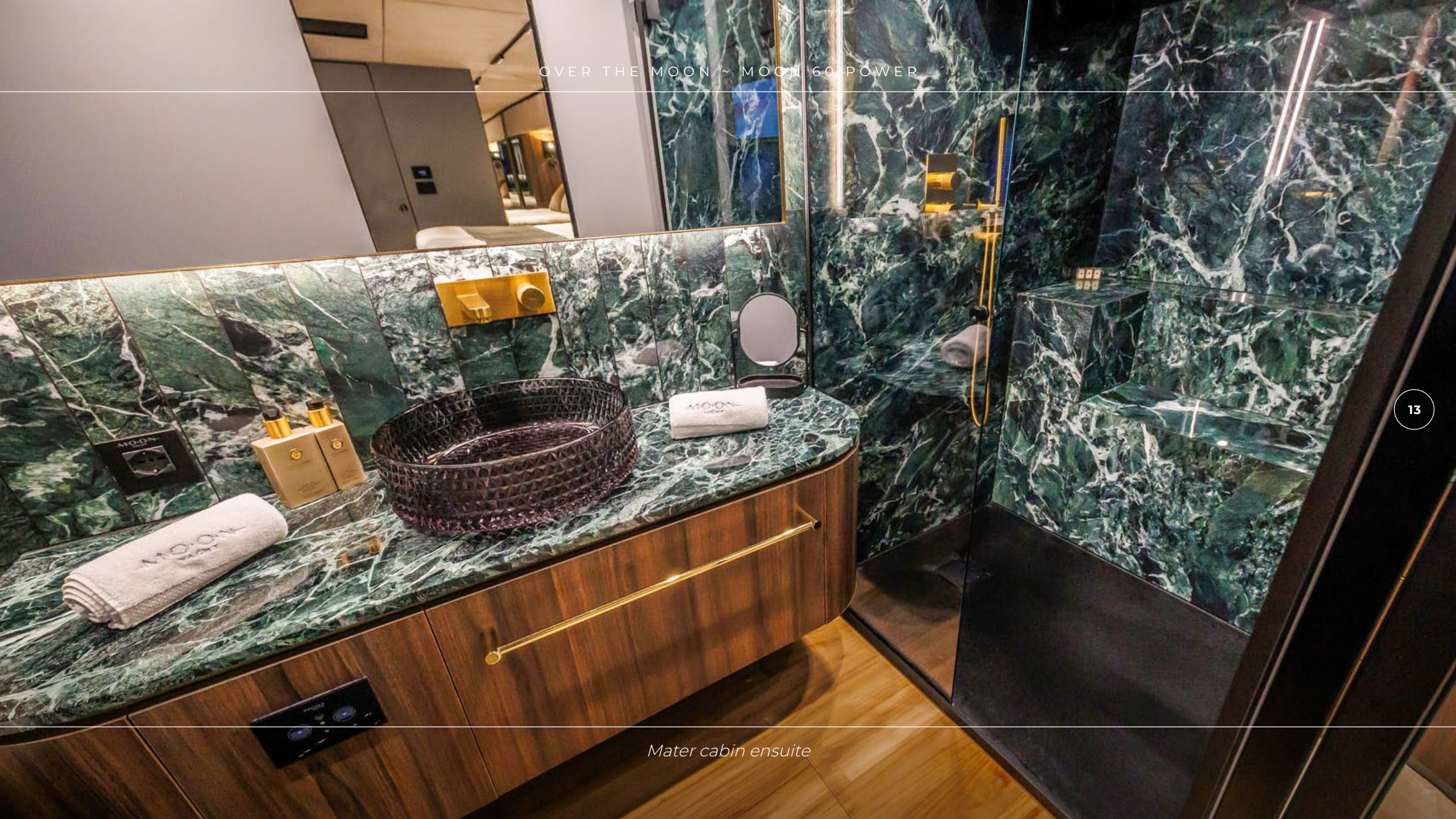
Mater cabin ensuite