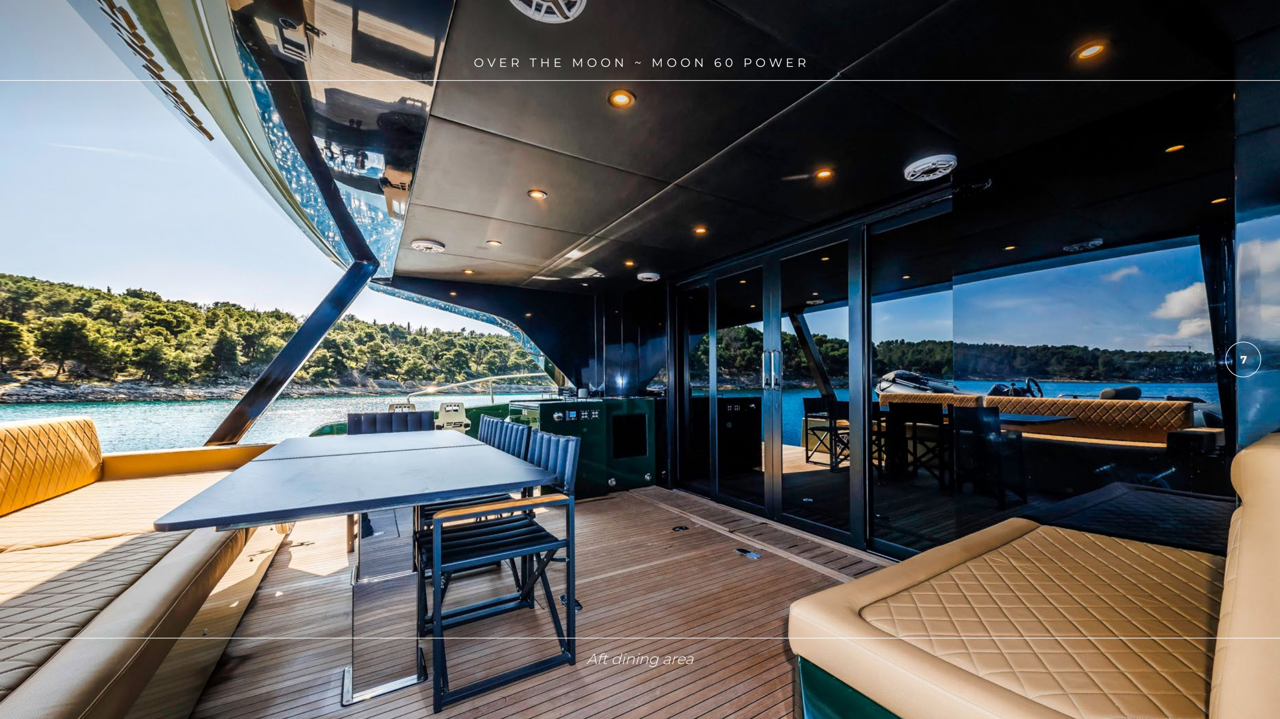
Aft dining area