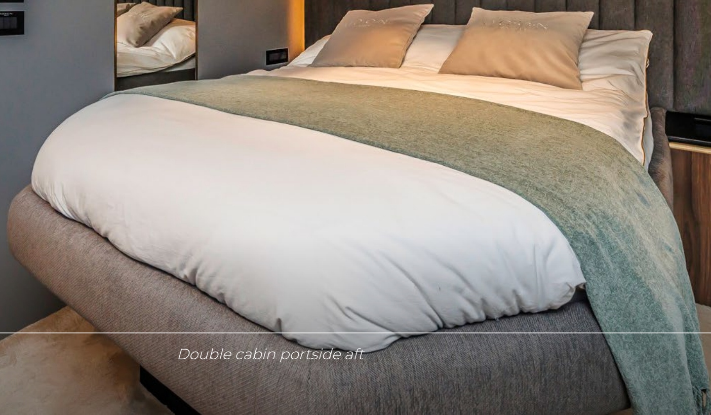
Double cabin portside aft