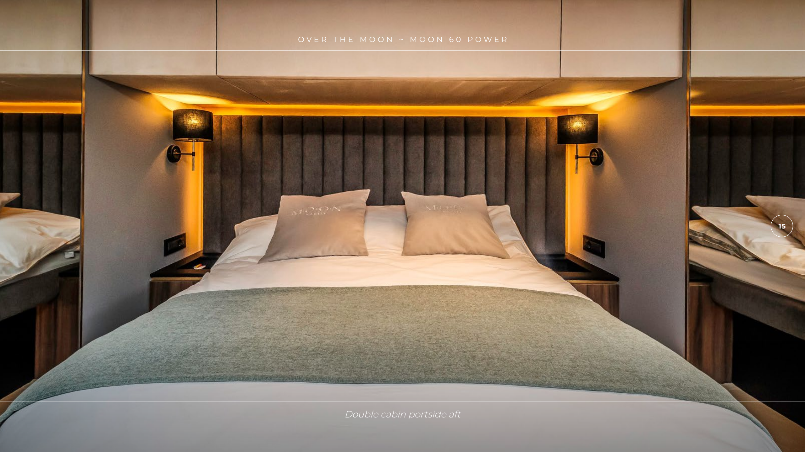
Double cabin portside aft