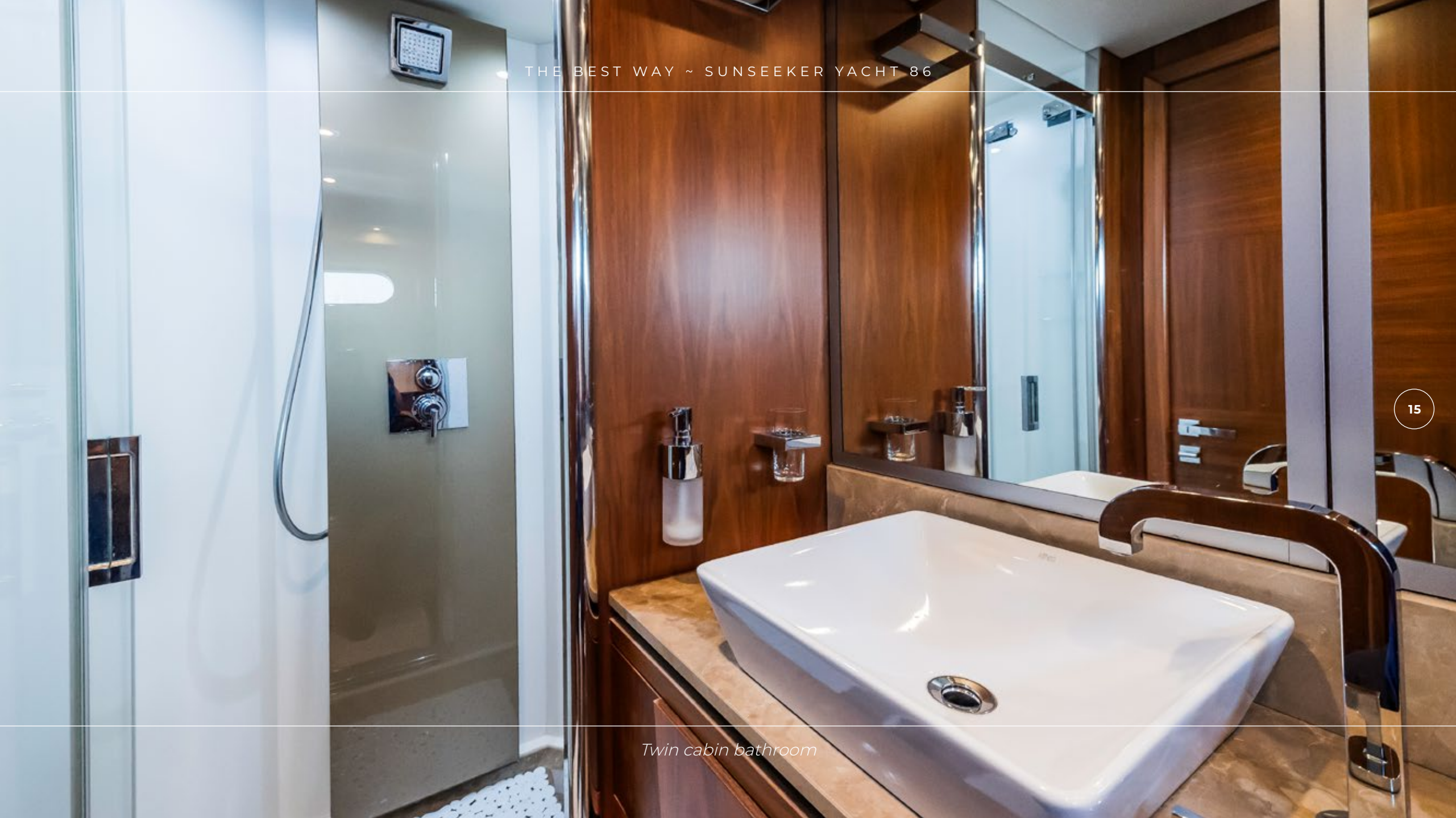
Twin cabin bathroom