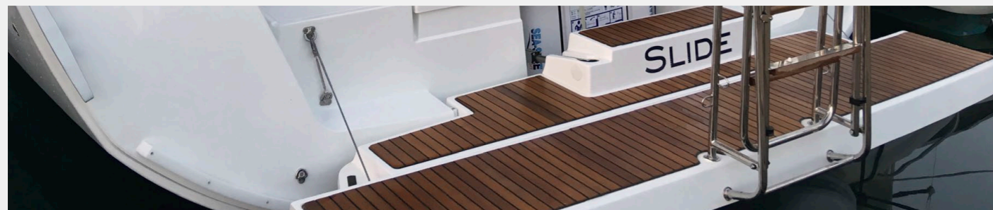
All images are original photos of "Slide" sailing yacht