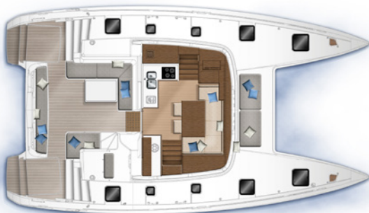
cabine / cockpit, if saloon / cockpit